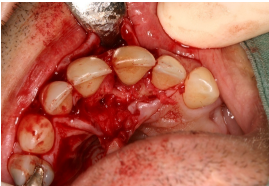
Defect mechanically debrided and rinsed with saline.