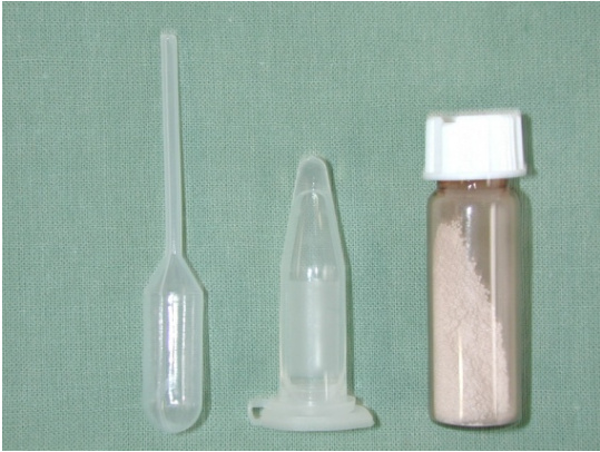
Fortoss ® Vital powder and fluid with dropper as supplied by the manufacturer.