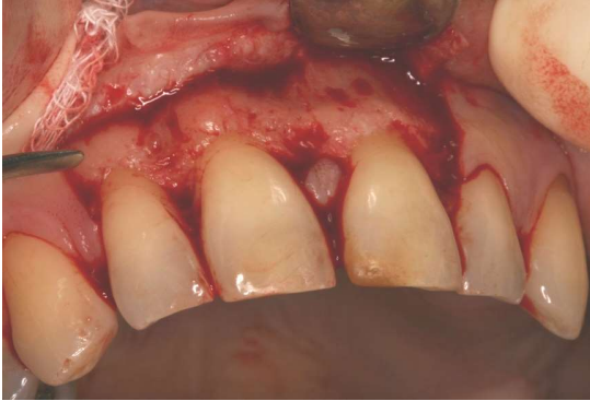
Full-thickness mucoperiosteal flap elevated on the vestibular side excluding the interdental pappila between the central incisors