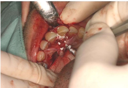
Graft material applied in to the bony defect